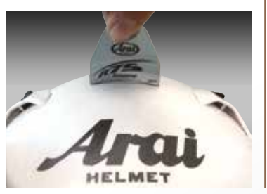
Different outer shells

All Arai helmets are warranted against defects in materials and workmanship, and are serviceable only for the properly fitted first user for 5 years from date of first use, but no more than 7 years from date of manufacture.