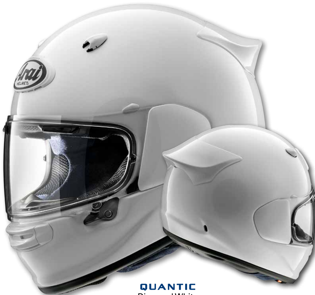
QUANTIC Diamond White

** Innovated and exclusively offered by Arai